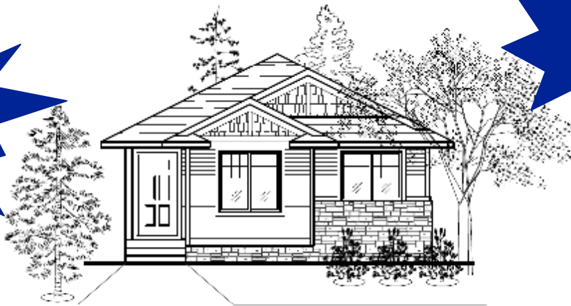
23 COOPER CLOSE, RED DEER 1131 SQ. FT. BUNGALOW

Build this plan as low as $182,520 *plus lot & GST