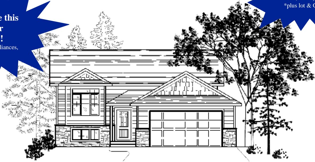
33 EASTPOINTE DRIVE, BLACKFALDS 1242 SQ. FT. BLEVEL

Purchase this Home for $352,449! *includes appliances, lot & GST*