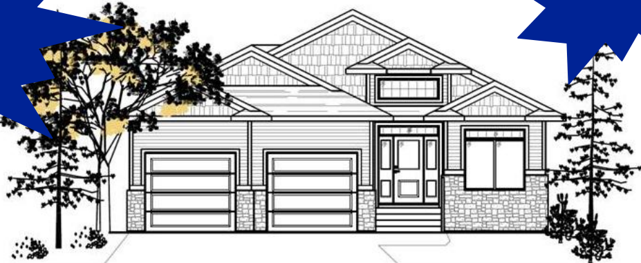
SYLVAN LAKE SHOWHOME TRUE-LINE CONTRACTING LTD.

Build this plan as low as $297,960 *plus lot & GST