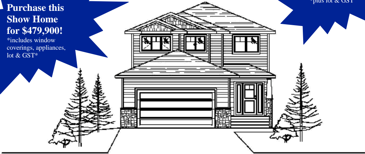
88 CARTER CLOSE 1926 SQ' 2 STOREY RED DEER, ALBERTA

Build this plan as low as $339,856 *plus lot & GST